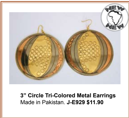
3" Circle Tri-Colored Metal Earrings Made in Pakistan. J-E929 $11.90