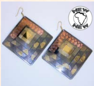
3" Diamond Tri-Colored Metal Earrings Made in Pakistan. J-E927 $11.90