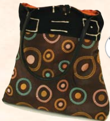
A Handbag that Says African Chic Have the handbag that stands out in any crowd with this mudcloth and leatherette bag. 16" X 16" Made in the USA. Mudcloth & Leatherette Oversized Handbag C-A060 $57.90