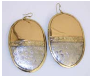
3" Oval Metal Earrings Made in Pakistan. J-E928 $11.90