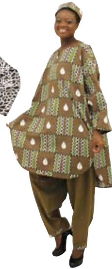
Cowrie Shell C-WF514