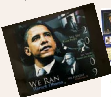
Barack Obama 12 Month Calendar 11" X 8.5". Made in USA. M-975 $9.98