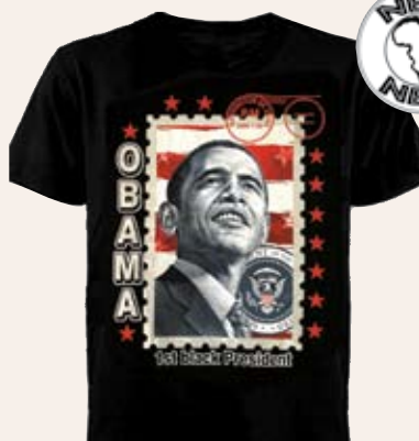
1st Black President Barack Obama Shirt 100% cotton. Machine wash. Available in sizes medium-4X. Made in Bangladesh. C-A988 $19.90