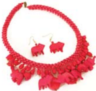
Pink Elephant Jewelry Set Made in the Philippines. J-S874 $7.90 each