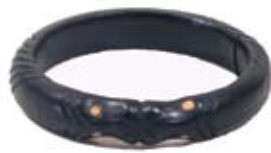
Wood Snake Bangle Made in Tanzania. J-B947 $3.98