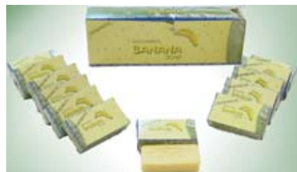
Set of 12 Small Banana Soap Bars 3 oz. M-S521S $1.98 per pack