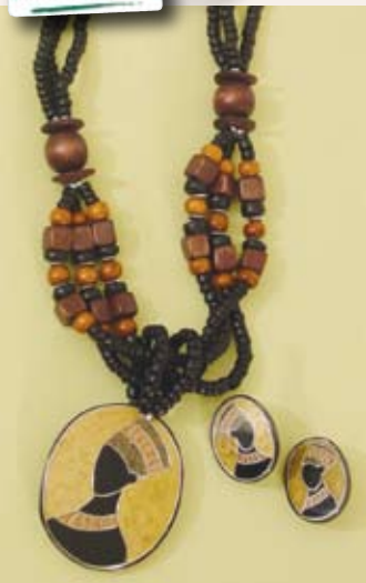
Nefertiti Beaded Jewelry Set Made in Philippines. J-S865 $11.90 each