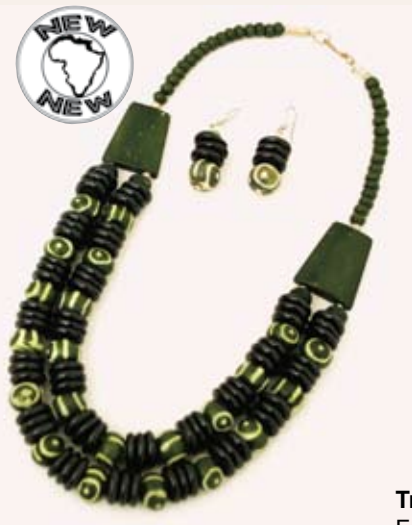
Green Bone African Jewelry Set Made in India. J-S834 $13.90 each