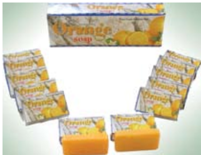
Set of 12 Small Nag Champa Orange Soap Bars 3 oz. M-S523S $1.98 per pack