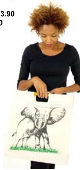
Elephant Jute Bag 19" X 18". Made in India. C-A914 $3.98 each