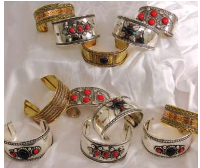
Assorted Wrist Cuffs You'll get a selection of brass and copper bracelets, silver stone bracelets, and more! Made in India. Set of 12 Assorted Wrist Cuffs J-SET22 $49.90