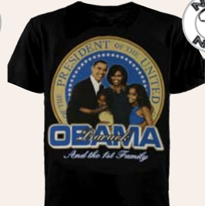
The 1st Family President Barack Obama Shirt 100% cotton. Machine wash. Available in sizes small- 4X. Made in Bangladesh. C-A989 $19.90