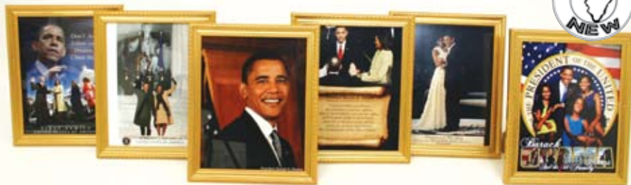
Gold Colored Framed Barack Obama Pictures 8" X 10". Made in USA. A-P968 $19.90 each Get the whole set of 6 A-P958S $99.50